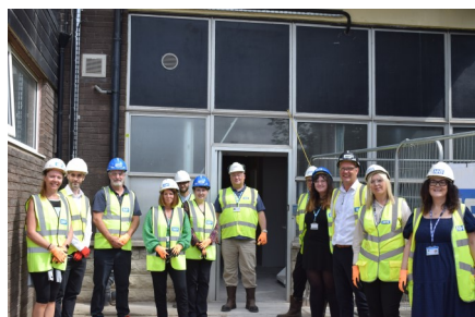
RLI New Oncology Unit Tour