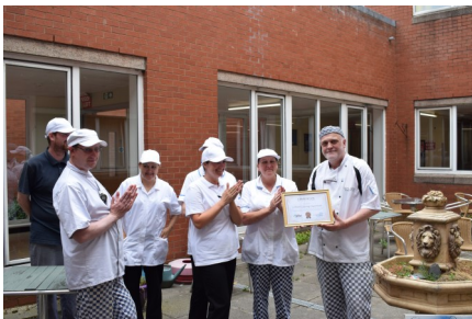
FGH Catering Team receive their award